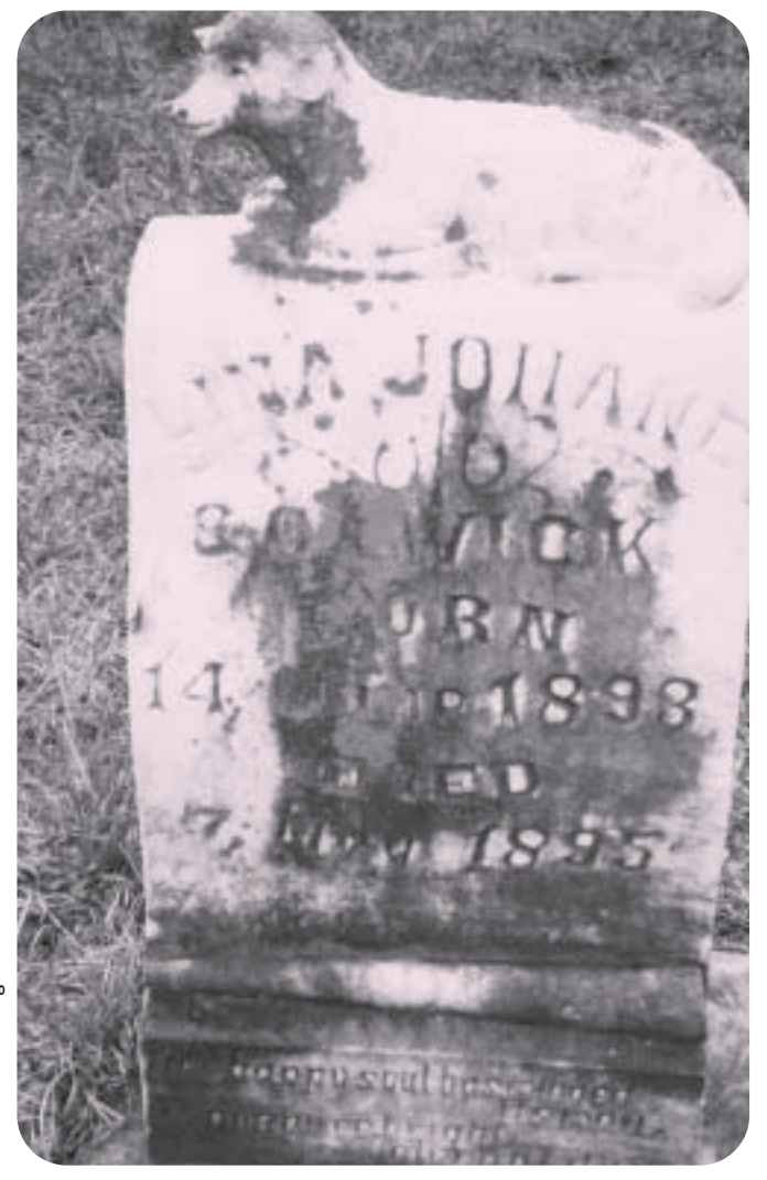
The woolly coat on the lamb adorning this infant's grave marker is disappearing bit by bit because of chemical weathering.