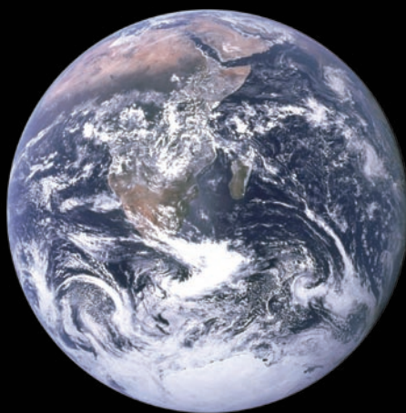
● THE EARTH