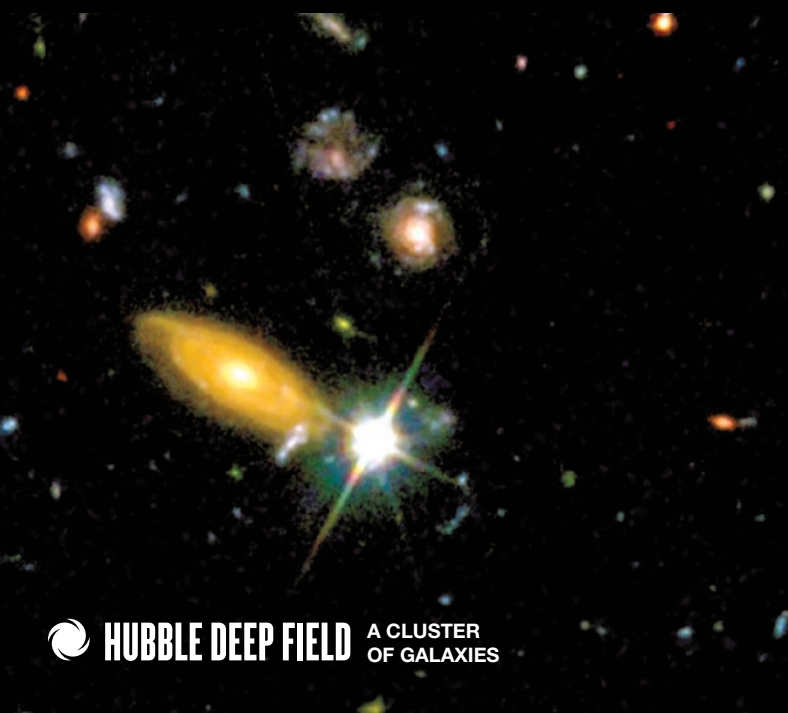
☾ HUBBLE DEEP FIELD A CLUSTER OF GALAXIES