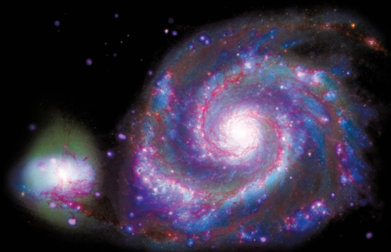
🌀 THE WHIRLPOOL GALAXY