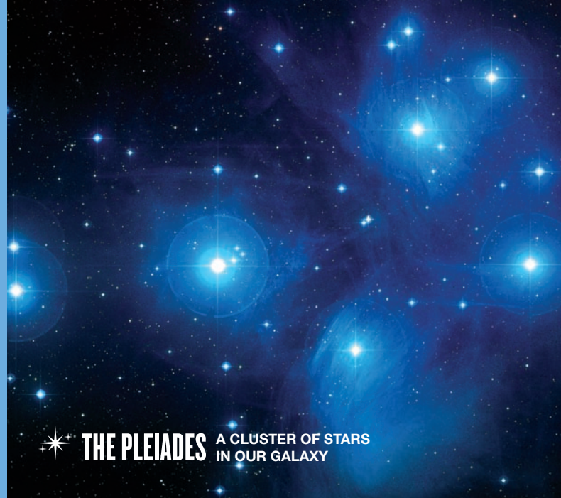
★ THE PLEIADES A CLUSTER OF STARS IN OUR GALAXY

THE LESSON IS ON PAGE 7 OF THIS ISSUE. ON OUR WEBSITE, YOU'LL FIND A PRINT-READY RECORD SHEET FOR STUDENTS. GO TO SMITHSONIANEDUCATION.ORG/UNIVERSE .