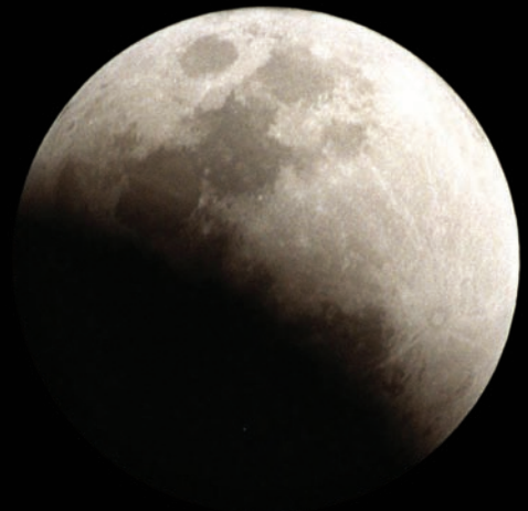
☾ THE MOON