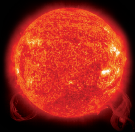
☀ THE SUN