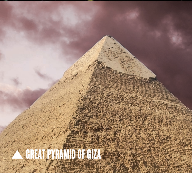
▲ GREAT PYRAMID OF GIZA