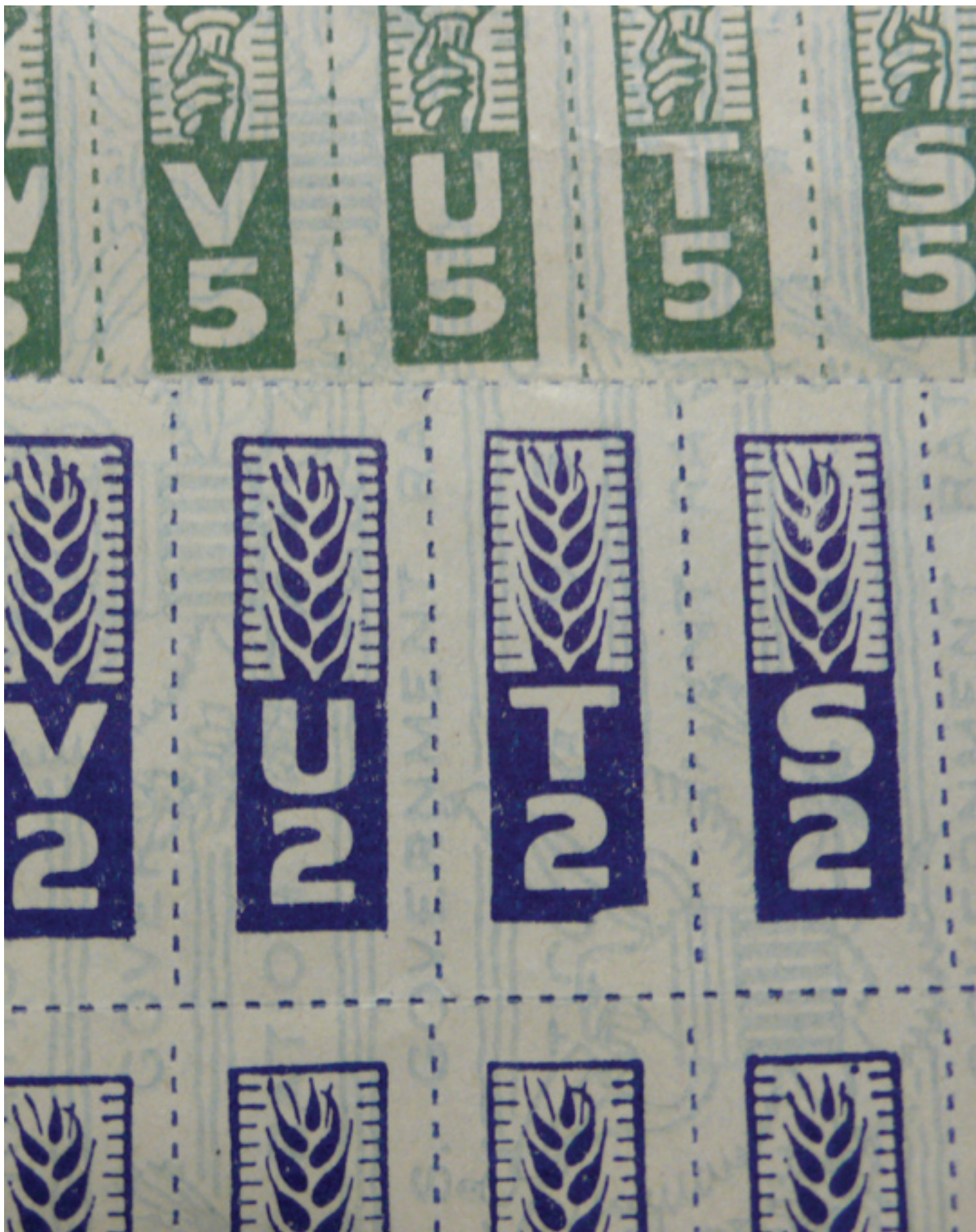
Ration Stamps from War Ration Book Number #4 (detail) (1943) Office of Price Administration Private Collection