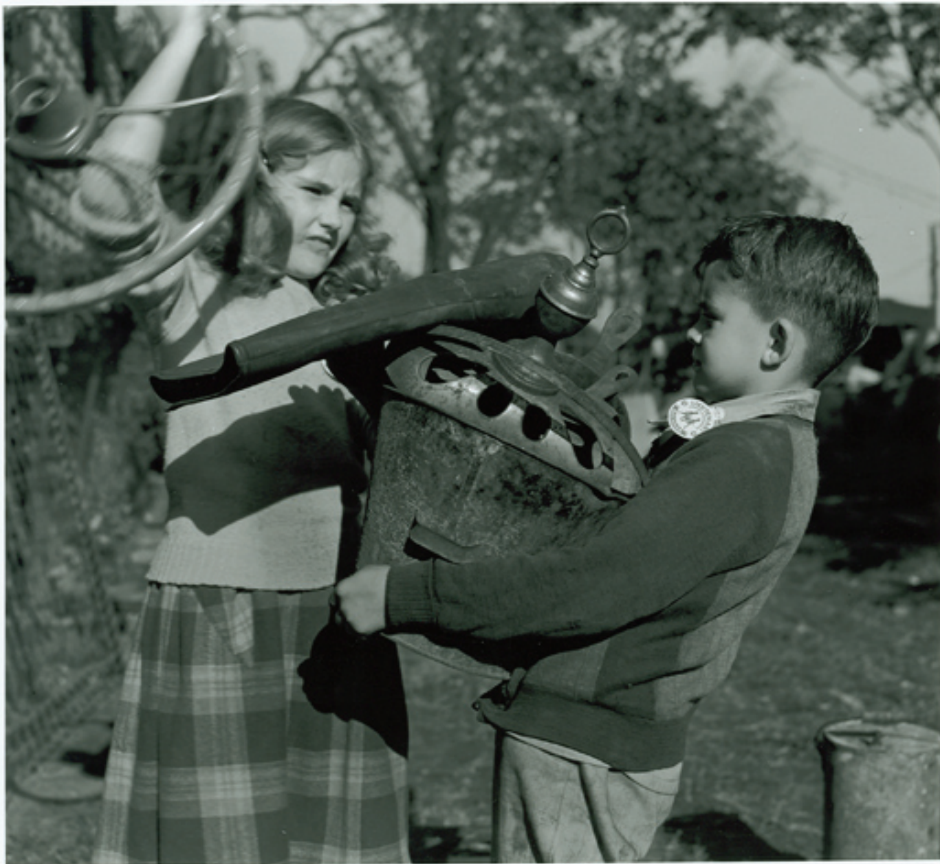
"Manpower junior size..." poster (Oct 1942) Sarra, Valentino, photographer, Office of War Information Library of Congress