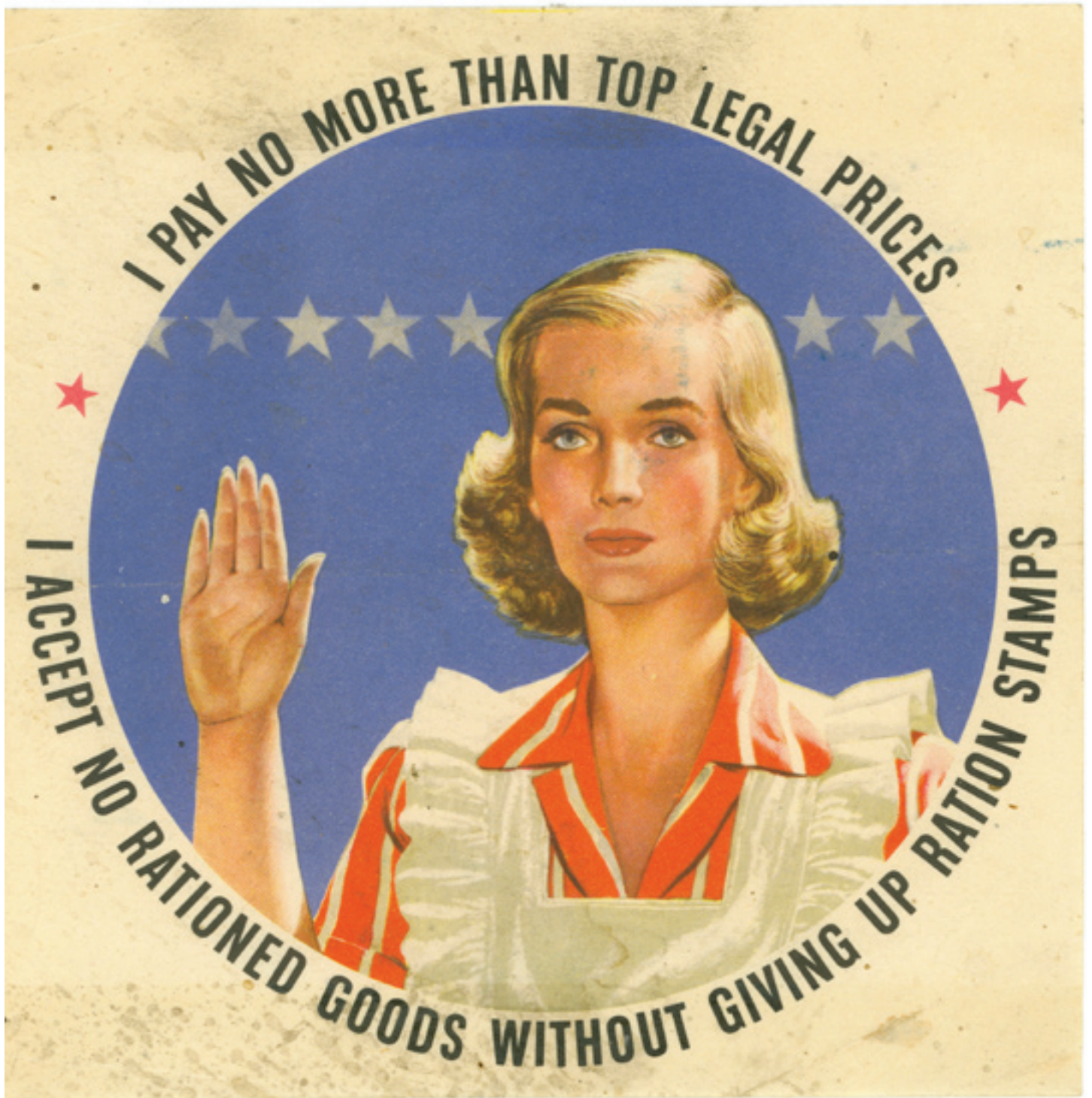
"I pay no more than top legal prices" sticker Private Collection