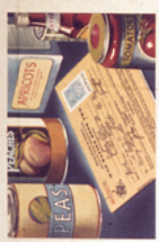
USE THIS BATION BOOK. You may use one are all of y family's ration books when you shop. You may not a with loose ration stamps.

.. to Buy Canned, Bottled and Frozen Fruits and Vegetables; Dried Fruits, Juices and all Canned Soups