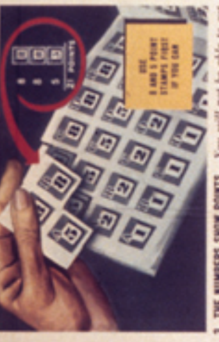
THE NUMBERS SHOW POINTS. You will not be able to hange. In point stanges, so note your less-colue sta busing four-to-land fonds.