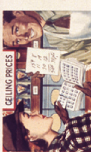
5. GIVE THE STAMPS TO YOUR GROCER. Treat out stemps in the personner of your grocer—or text them out in the presents of the delivery has