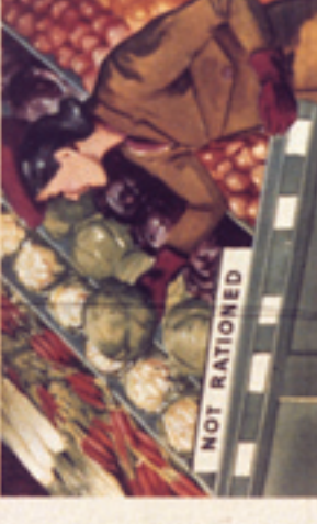
6. FRESH FRUITS AND MERETABLES are not rationed. Lie th instead of reationed foods whenever possible. Try-