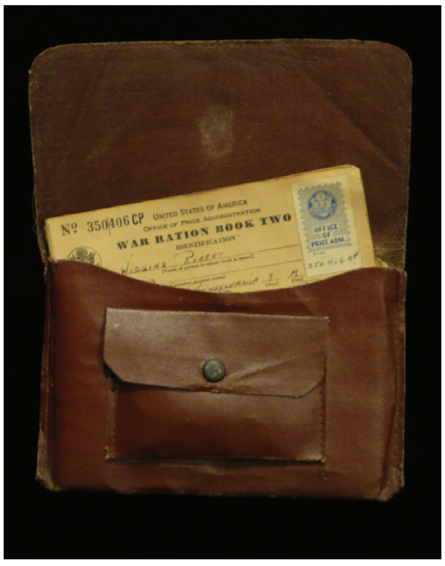
Ration Book Holder Private Collection