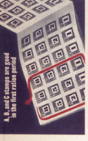
USE BLUE STAMPS ORLY. All blue point stomps morel. B. and C. are good during the first ortion period. The old up to 68 points for each member of the family.