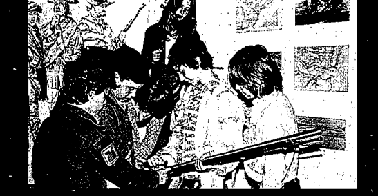
At the National Museum of History and Technology