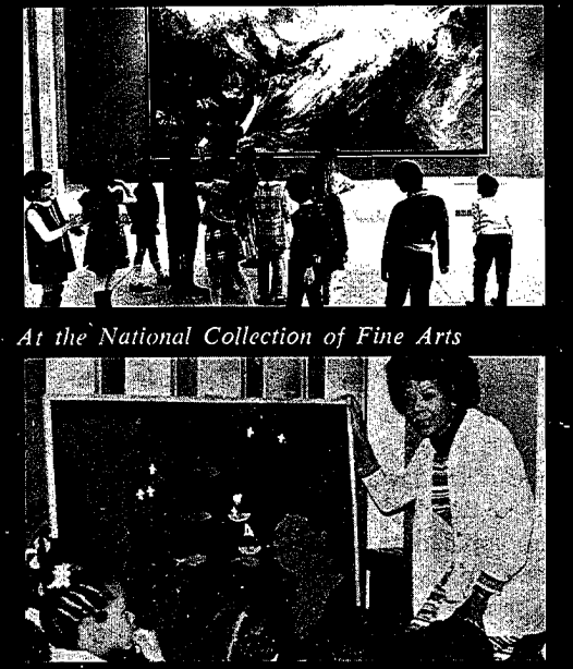
At the Anacostia Neighborhood Museum.

Mention the Smithsonian and most people think Kitty Hawk Flyer, First Ladies' gowns, and auractions there is much more to this institution than first meets the eye.