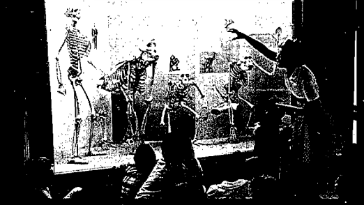
At the National Museum of Natural History

What can you learn from a portrait? That depends on what kind of a portrait you have. Some artists attempt little else than to describe what a person looked like. But others try to do more-they place in their works "clues" to an individual's occupation, achievements, or interests. Even eight-year-olds can be successful at "reading" such portraits, and most will enjoy the process.