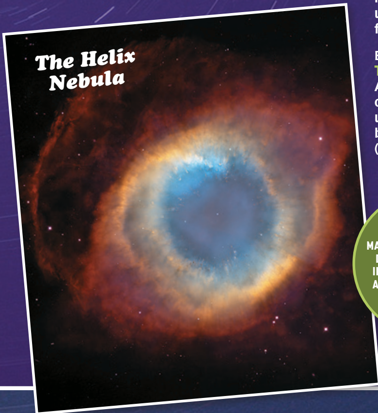
The Helix Nebula

Be sure to check out the HUBBLE TEST TELESCOPE in Space Race (Gallery 114). Astronauts once practiced their repair tasks on this telescope here on Earth before heading up to fix the real thing. Also, check out the back-up Hubble mirror in Explore the Universe (Gallery 111).